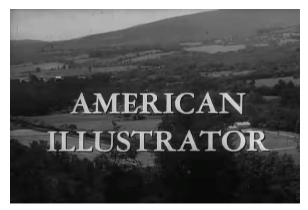
Figure 6: American Illustrator (1962), title screen [NARA 306.1769]

PV: And that means something, because these people would be shocked for you to claim they're propagandists. They really believed what they were saying. Again, if I was to get a group of my